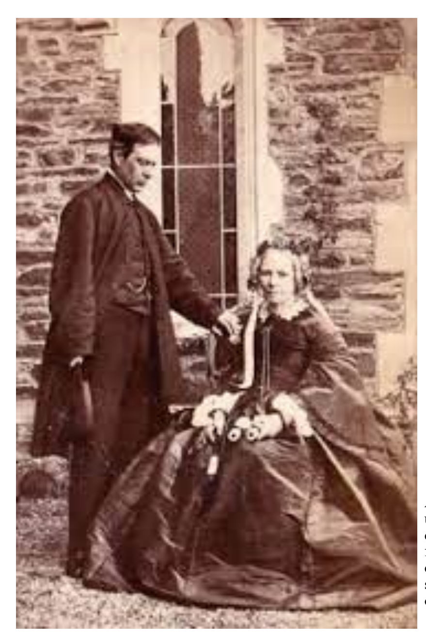
An unknown couple in front of a church very similar to ours. 1880.

Trinity Episcopal Church 484 Lime Rock Rd. Lakeville, CT 06039 860-435-2627 www.trinitylimerock.org