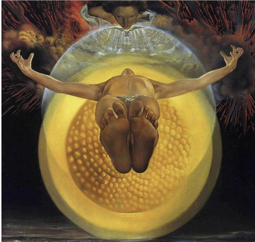
"Salvador Dali, The Ascension of Christ"